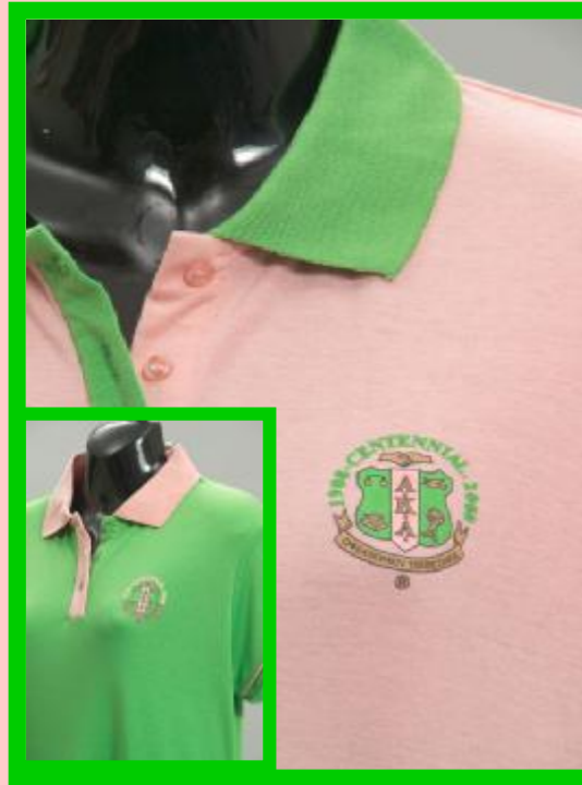
CENTENNIAL POLO: $35 (FABRIC: COTTON/SPANDEX) *EMBROIDERED LOGO