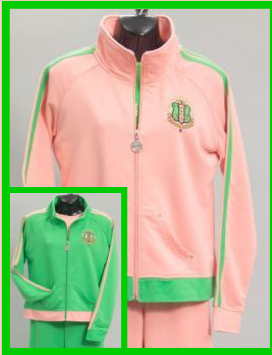
CENTENNIAL SUIT: $110 (FABRIC: FRENCH TERRY)