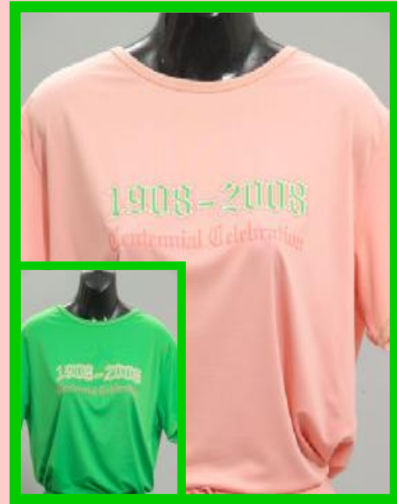
CENTENNIAL TEE: $30 (FABRIC: POLY-SPANDEX)

REALGREEK APPAREL (RGA) HAS PARTNERED WITH AKA. PART OF THE PROCEEDS FROM THE CENTENNIAL PRE-ORDERS (8-18-08 THRU 10-5-08) WILL GO TO BENEFIT THE EDUCATIONAL ADVANCEMENT FOUNDATION (EAF).